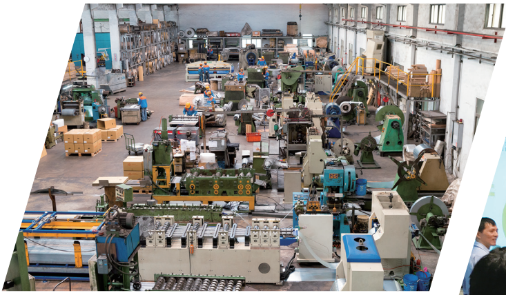
生產線 Production line