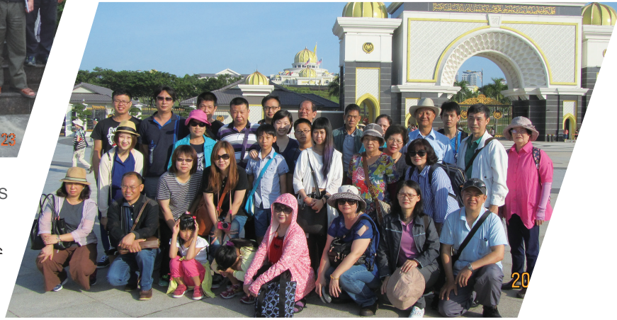
公司旅遊 Company incentive tour