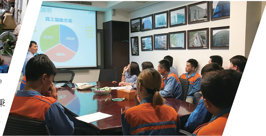
員工教育訓練 Employee training

上鎧鋼鐵係由董事長林宗志先生，秉持著「誠信」與「品質」為本的信念，於1988年一手創立，至今亦已續證通過品質管理系統認證ISO 9001。上鎧雖為擴張網產業的後者，但靠著不斷地自我要求進步與創新，今日已成為我國產業用金屬擴張網（Expanded Metal Mesh）產品業界之龍頭。30年來，透過跨國合作導入新技術，加上內部軟硬體皆持續地汰舊換新，讓產品多樣與質量兼備，除國內市佔率超過60%外，更外銷出口至香港、澳洲、日本、美國、新加坡、印度、歐洲、阿拉伯、紐西蘭及巴拿馬等地區，至今全球大大小小客戶已超過1千家並獲得客戶們的一致肯定，儼然成為當今臺灣傳統產業的典範與驕傲。